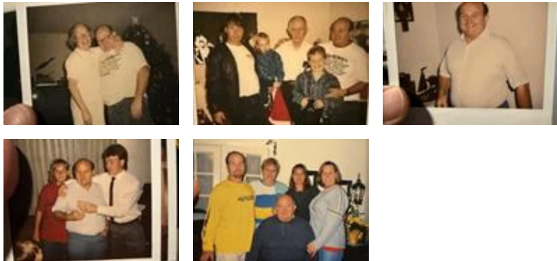
Steven Miller - December 13, 2025 at 03:55 PM

“What a great man. You will be missed by us all. I will forever cherish all the great memories I have of riding in the mountains to go launch the boats. The memories of you teaching me how to do fiberglass on the lifestyles. And how to get that epoxy off your hands when we made a mess of it. The memories of riding around with you in your little green car. The memories of riding around with you in your truck with a whole bag of curly fries from Jack-in-the-Box. Every memory of you is a special one. I remember going down to that basement in Hanford to eat pickled eggs Most people were afraid of them, but I absolutely loved it. I stayed with you a lot. I wouldn't be half the man I am today if it wasn't for you. I remember sitting in that big concrete boat scared to climb the ladder to get up to it scared to climb a ladder to get down into it. But you always made everything feel safe, even when you threw me off the back of that boat to teach me how to swim. I will forever tell the stories to my children friends, and family. I will miss your laugh. I will miss your smile. I will miss your voice. I miss those conversations on the phone, just talking about boats and motors and all the things you've done in your life. I know now that you are sailing on that beautiful sailboat on perfect water. Forever in all of our hearts and especially mine. Your oldest grandson Steven Miller -